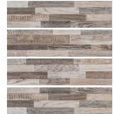
— Wilwood 6" x 24" 82501