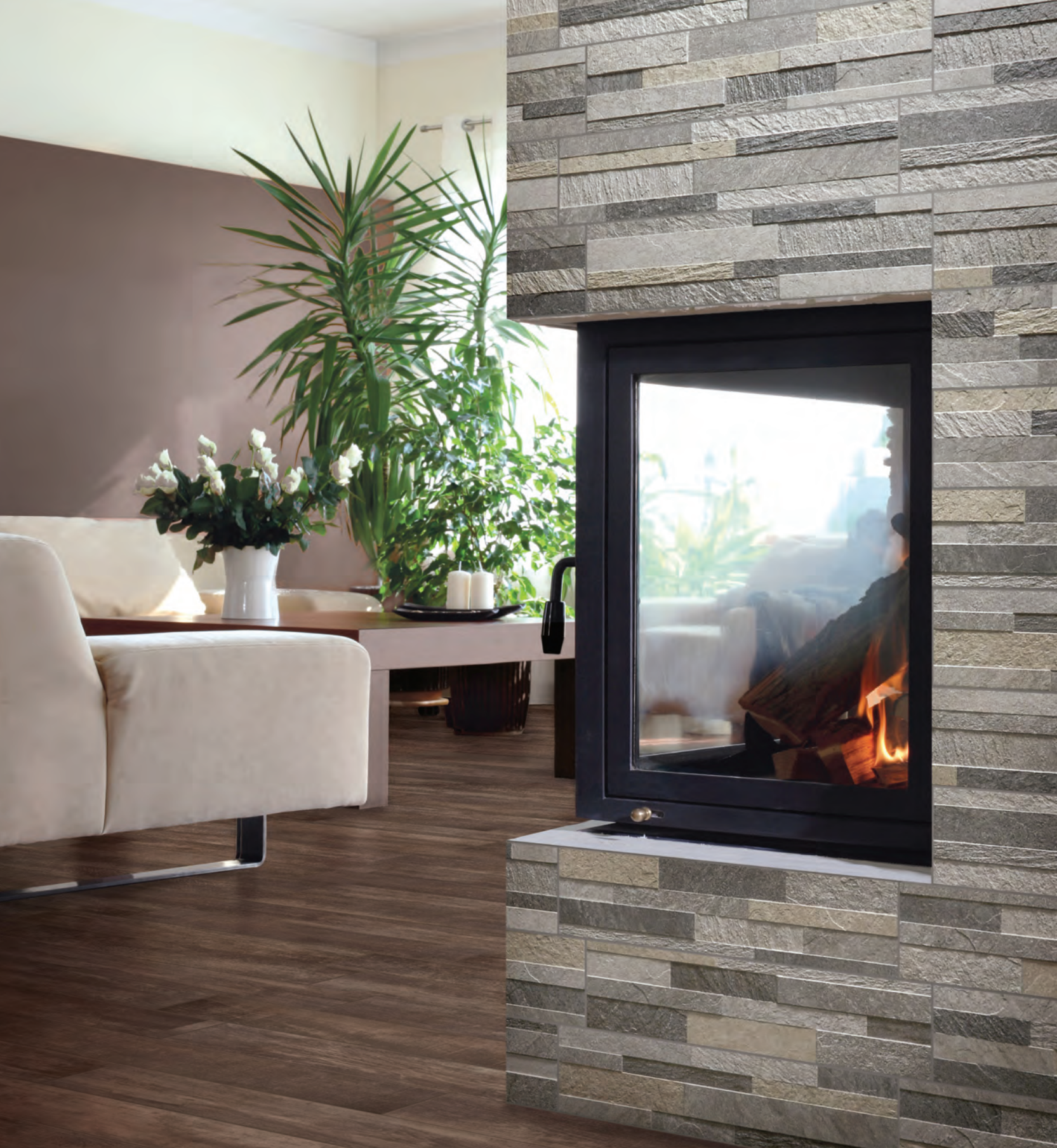
Stoneriver — 6" x 24" Porcelain Panel (82503)