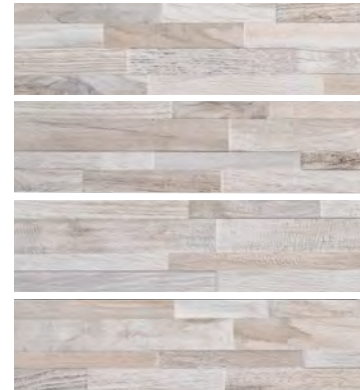
— Timberwolfe 6" x 24" 82500