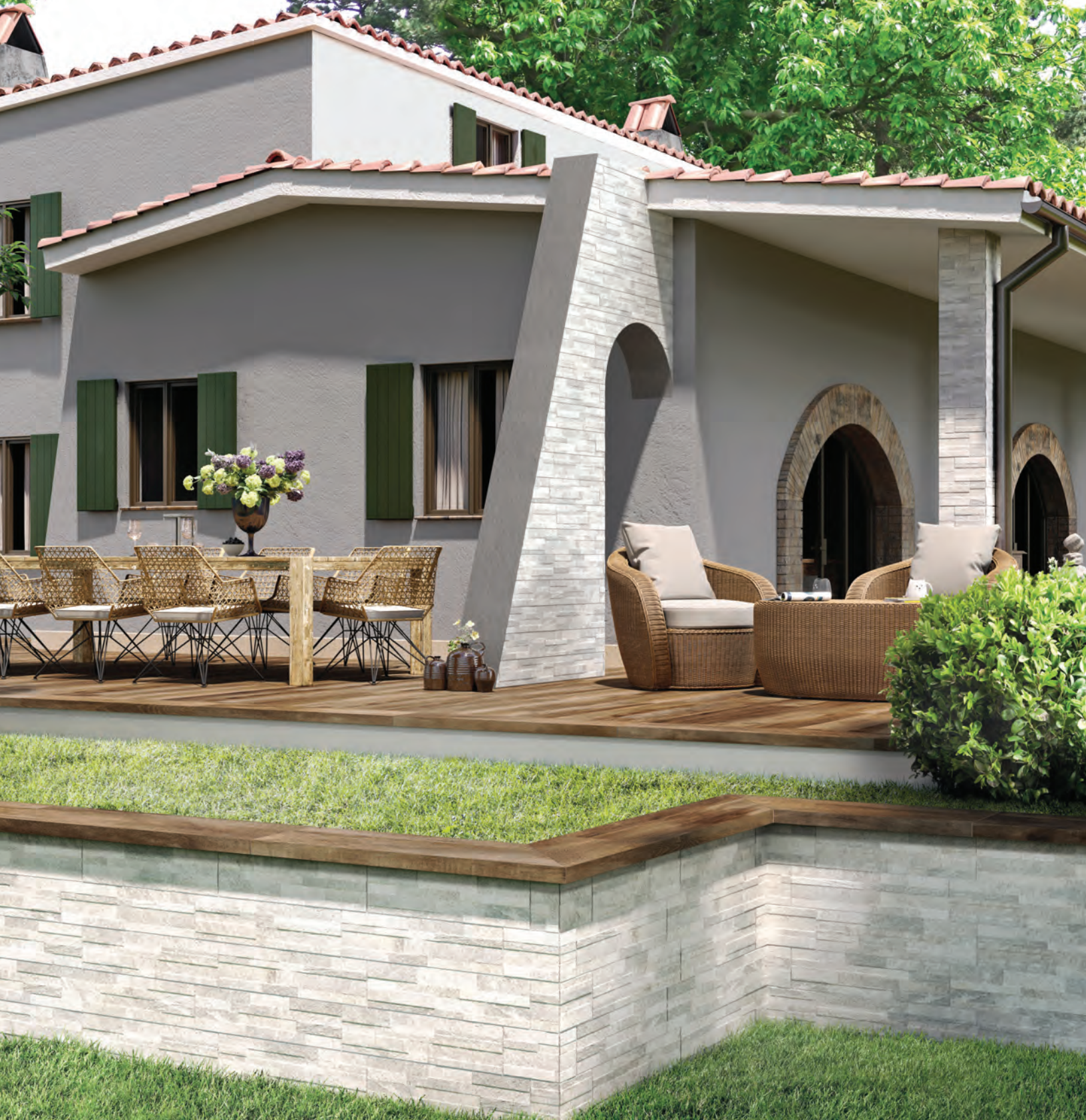
Fresh Spring 6" x 24" Porcelain Panel (82502)