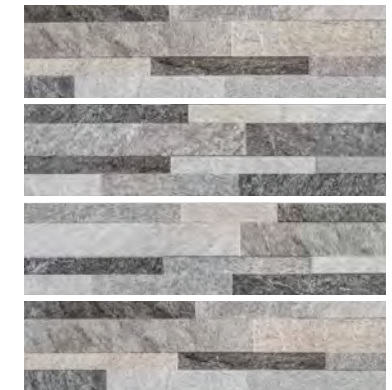
— Stoneriver 6" x 24" 82503